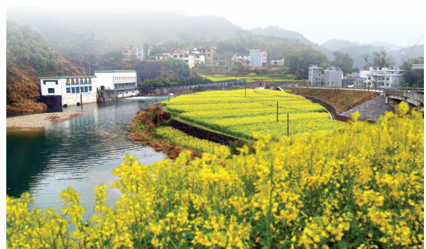
Qixi small hydropower station, Kaihua County, Zhejiang Province

In terms of development and management of small hydropower, by the end of 2014, over 47,000 rural hydropower stations were completed mostly being small hydropower stations, registering a total installed capacity of over 73 million kW, and power output of over 220 billion kWh in 2014, which is equivalent to substitution of 73 million standard coal and reduction of 183 million metric tons of CO 2 emission. At the same time, the ecological protection project that replaces fuels with small hydropower is in place. It not only addresses fuel problems of millions of mountainous farmers and improves their living standards, but also protects more than 300,000 hectares forests and restores the local ecological environment.