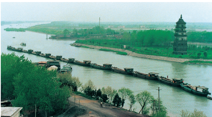
First excavated in 486 B.C., Beijing-Hangzhou Grand Canal was completed and navigated in 1293. With a total length of 1,794 km, it is the longest, biggest and oldest artificial canal in the world.

Since 1949, especially since the reform and opening up, China has developed water conservancy on a large scale. The resultant fairly complete system of water works enables China to successfully respond to frequent water and draught hazards, and effectively guarantee flood control security, food security, water supply security and ecological security. For the 30-plus years since the reform and opening up, the Chinese economy has maintained a high annual growth rate of nearly 10%, whereas total quantity of water consumption has only increased slightly. In effect,