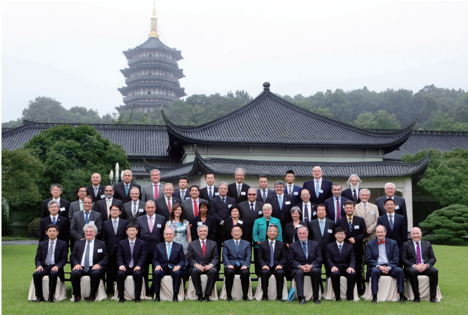
World Water Council 55th Board of Governors Meeting, Hangzhou 16-17 July 2015

Water is the foundation of survival, source of civilization and key to ecology. With a large population but limited water resources plus uneven distribution of water resources in time and space, China is confronted by arduous tasks in water saving, water governance, water management and development of water conservancy. Over the recent years, the Chinese government has explicitly put forward its guiding principles on water management for the new era, namely, “prioritizing water saving, spatial balance, systematic governance, and equal attention to conservation and development”, with a view to actively implementing the mindset of water governance for sustainable development, speeding up the transformation from traditional to modern and sustainable water management, reinforcing water management, effectively ensuring water security, and promoting sustainable socioeconomic development with sustainable use of water resources. For the moment, China is striding towards the “two centennial goals” (to construct a well-off society on all fronts by the centennial of the Communist Party of China,