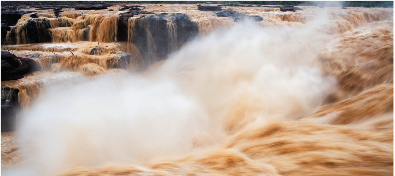
Hukou Waterfall on the Yellow River

China has ensured a national economic growth that is 3 times the world average, with only 60% of the world average per capita water resources. Moreover, while keeping water consumption for agricultural irrigation at zero growth for 30 consecutive years, the country has almost doubled its grain output. With only 6% of the world's freshwater resources and 9% of the world's arable land, China has fed about 1/5 of the world population, a marked contribution to world grain security.