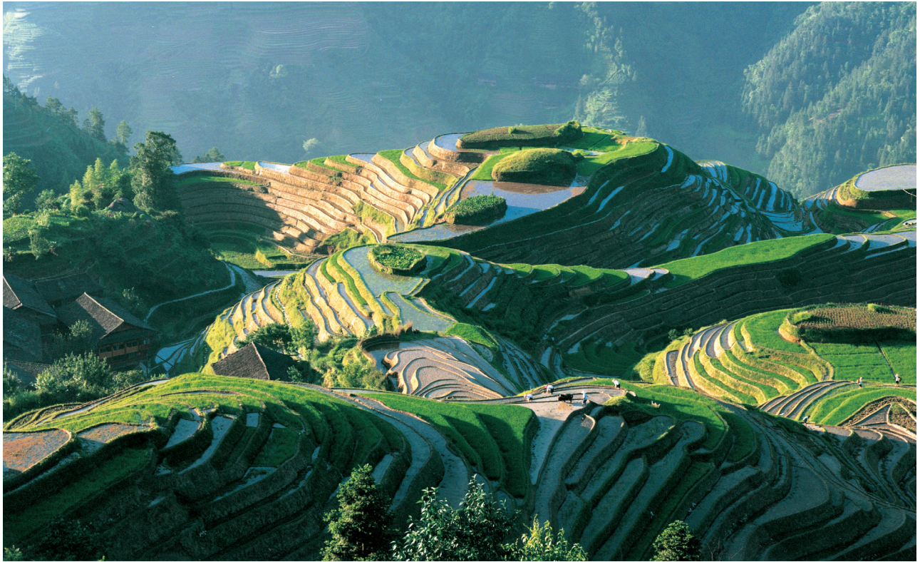
Terraced paddy fields in Yunnan Province

conservation measures can reduce soil erosion by 1.5 billion metric tons per annum, increase water storage capacity by more than 25 billion m 3 , and raise grain output by 18 billion kilograms.