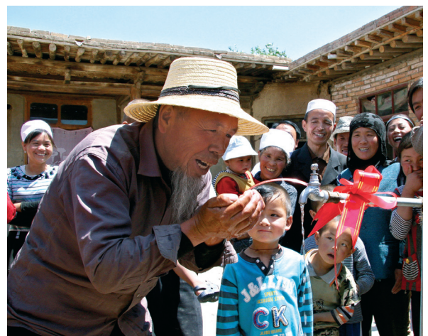
The ethnic minority people taste “the Water of Happiness” in Dongxiang Autonomous County, Gansu Province

For farmland water conservancy, China has 456 irrigation districts with designed irrigation area of 20,000 hectares each, recording a total irrigated area of 18.667 million hectares; and another 7,316 irrigations districts with designed irrigation area of 667~20,000 hectares each, coming up to 14.867 million hectares in total irrigated area. From the early days of the PRC to 2014, irrigated arable land expanded from 15.933 million hectares to 64.54 million hectares, irrigated forage land extended to 850,000-plus hectares, and total grain output grew from 113.20 million metric tons to 607.099 million metric tons.