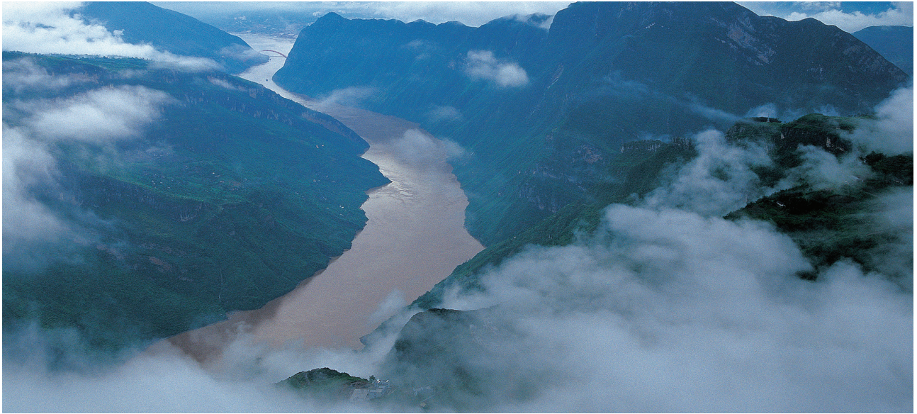
The Yangtze River, the third longest river in the world

in water and draught disasters. Throughout its 5,000-year-long history, the Chinese nation has always regarded water governance and water conservancy development as a major issue in governance and stability of the country. The development history of the Chinese nation, to some extent, is a history of water governance. Many renowned ancient water works such as Dujiang Weir, Lingqu Canal and the Beijing-Hangzhou Grand Canal are hitherto still serving important functions. They are glorious examples in the history of water governance.