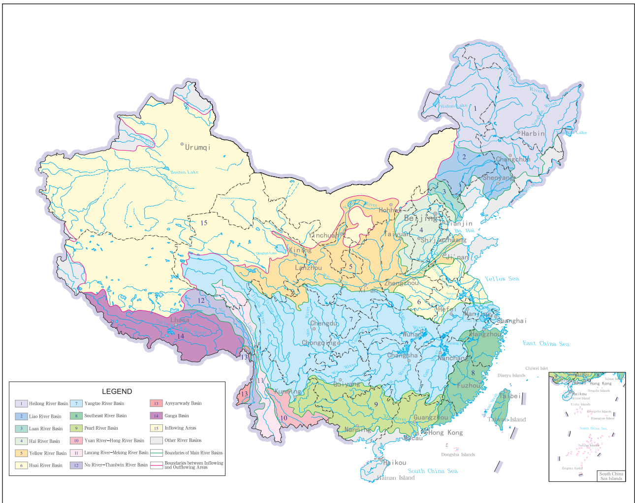
China's river systems

the precipitation is concentrated in the flood season, which makes China very prone to spring draughts, summer floods and continuous flooding and draught. Moreover, the distribution of water, land and mineral resources mismatches the layout of production forces. Whereas South China is abundant in water, the north is very short of water resources. North China (north to the Yangtze River Basin) takes up 63.5% of the national territory, but only 19% of the national water resources.