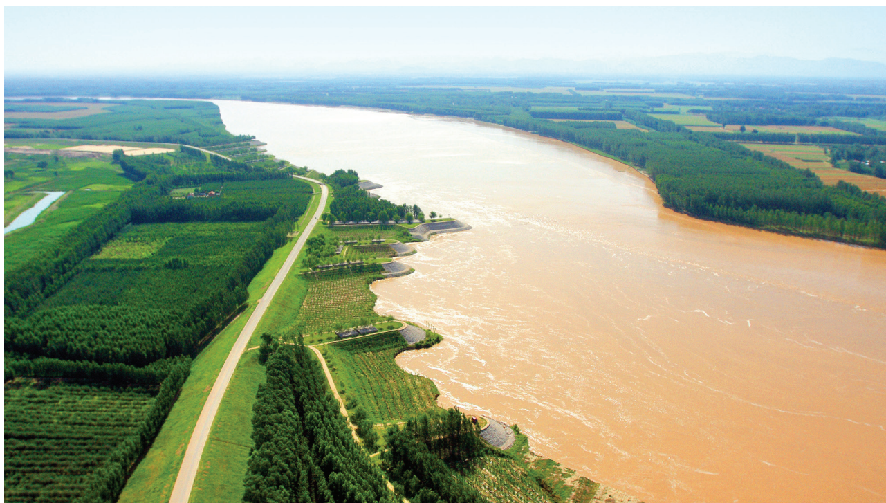
The Standard Dyke of the Yellow River

In soil and water conservation, since 1949, China has placed under control an area of 10.47 million km 2 that had once suffered water loss and soil erosion, harnessed over 70,000 watersheds, built more than 1,000 ecologically clean watersheds, achieved ecological restoration via water and soil conservation for an area of 720,000 km 2 , and covered more than 600 counties suffering severe water loss and soil erosion with the implementation of national water and soil conservation projects. Existing water and soil